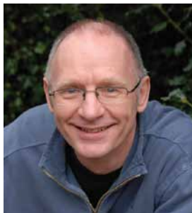
James Robertson

James Robertson Honorary President, Ullapool Book Festival